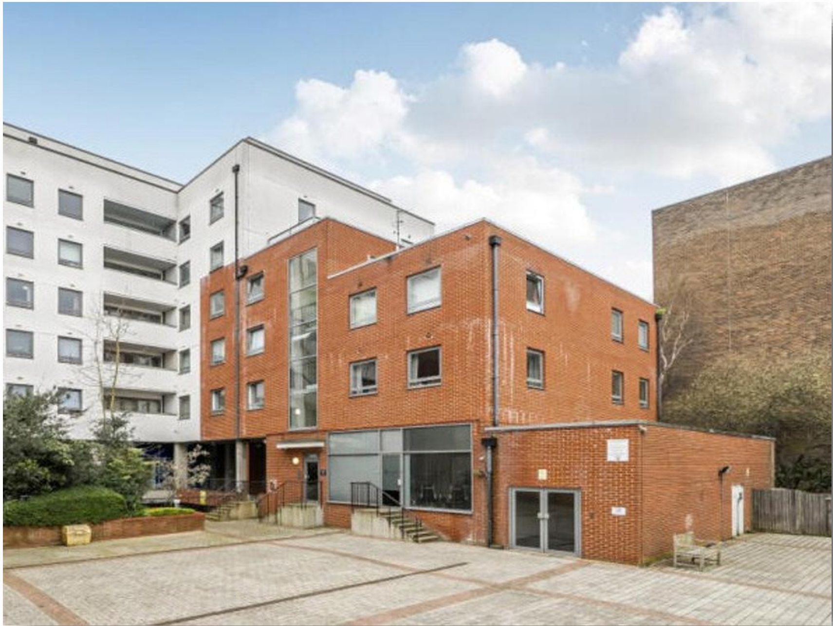
Ashleigh Court, Loates Lane, Watford, WD17 2PJ