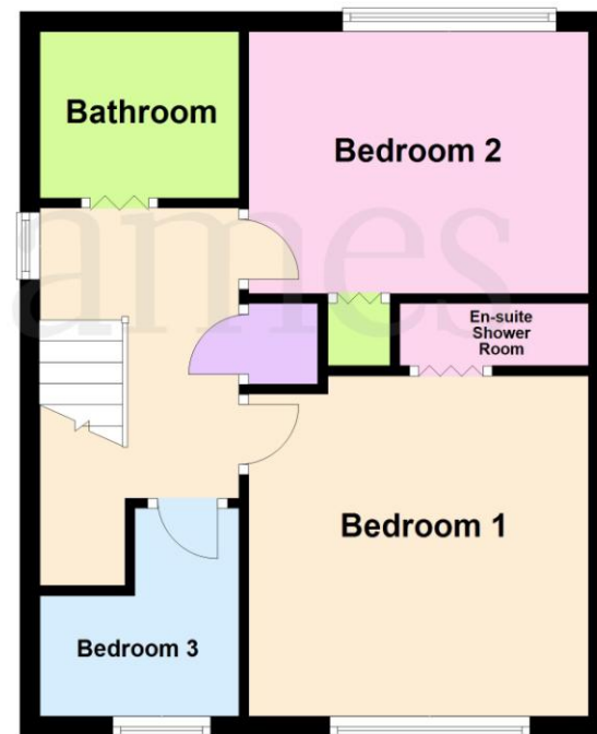
First Floor Approx. 500.5 sq. feet