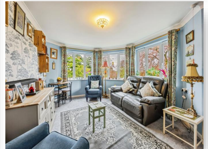
Lalgates Court, Harlestone Road, Northampton, NN5 7AF