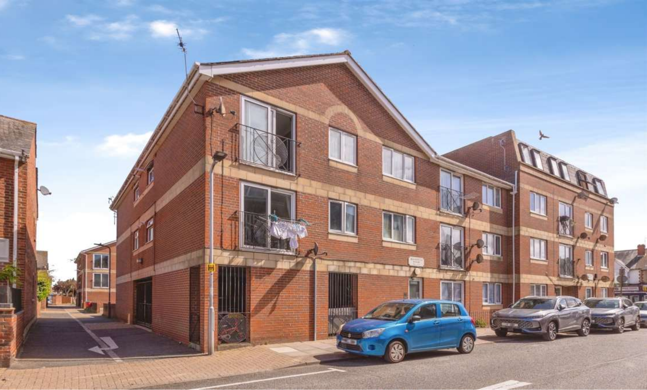
Woodfield House Meredith Road, Portsmouth PO2 9NW