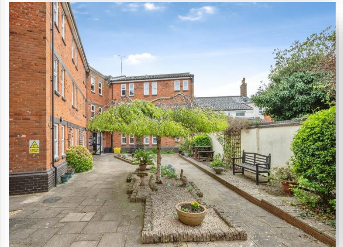
Angel Court, Cromer Road, North Walsham NR28 0UN