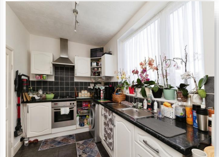
Thorntree Avenue, Middlesbrough TS3 9BJ