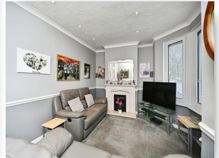
Bear Road, Brighton BN2 4DB