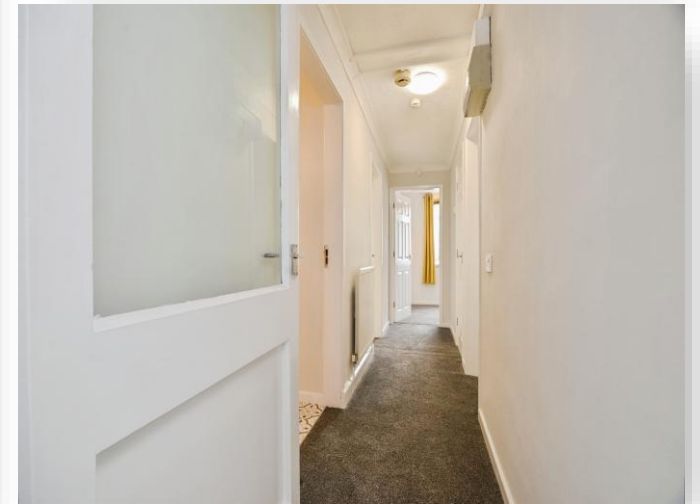
Haswell Court, Stockton-On-Tees TS20 2AZ