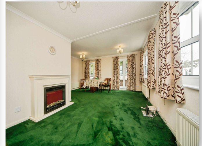
The Ranch Mobile Home Park, Hitcham Ipswich IP7 7LW