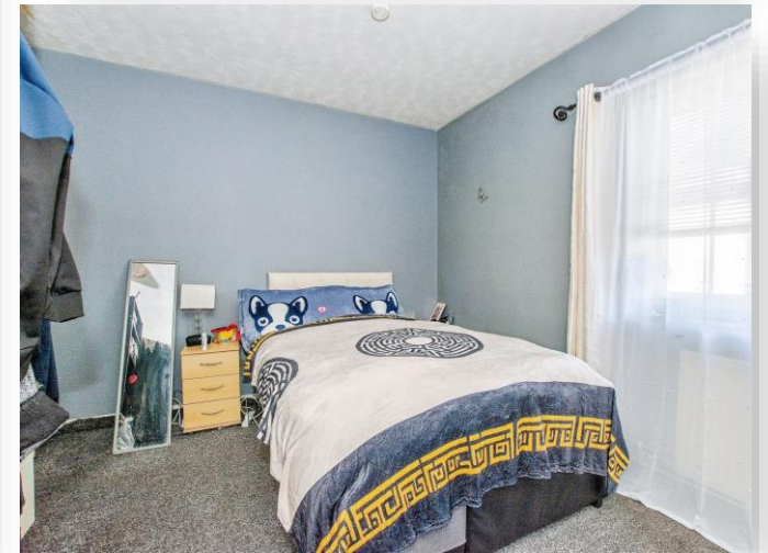
Church Mews, Wisbech, PE13 1HL