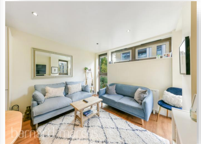
Carter House Petergate, London SW11 2BF