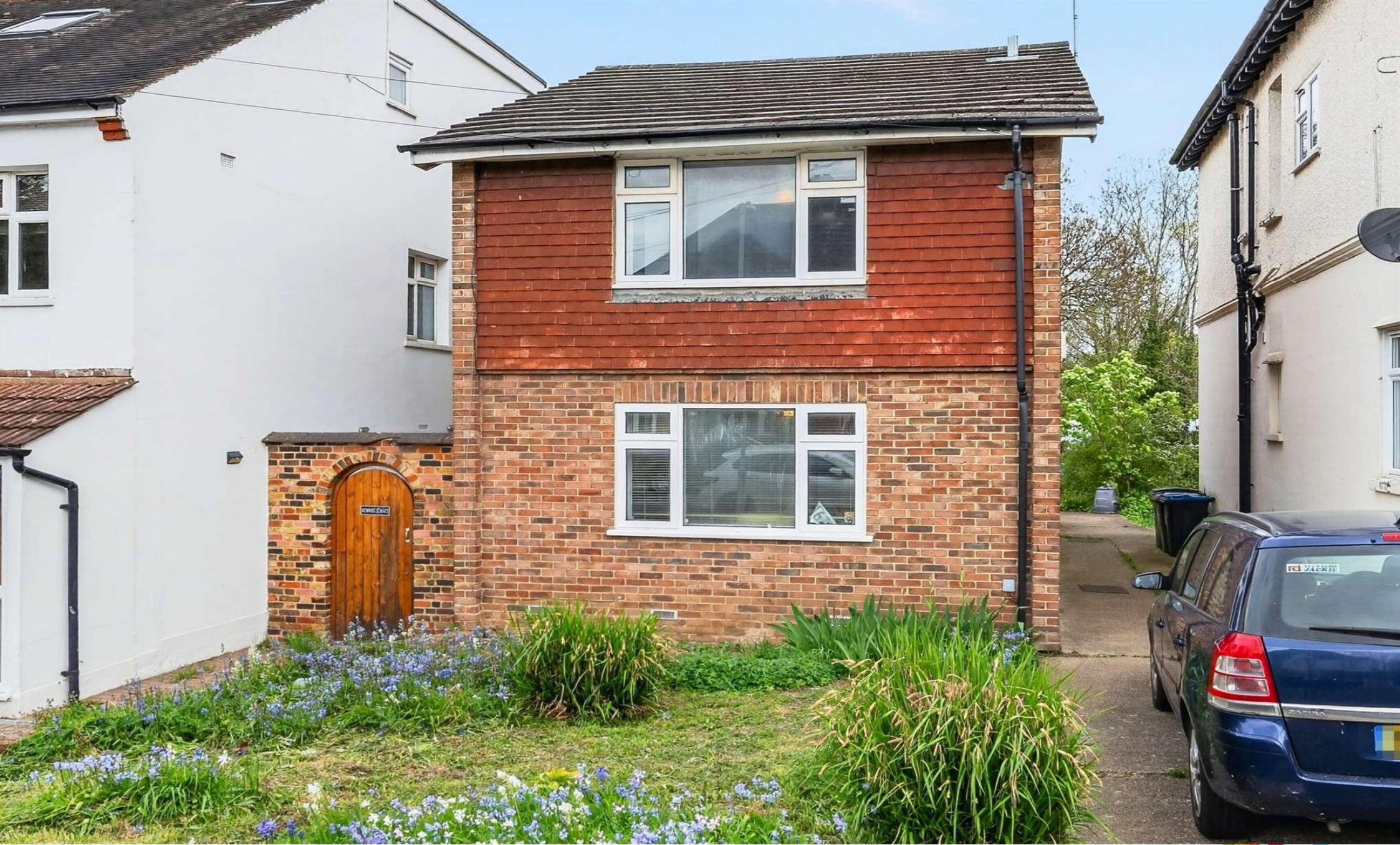
Dukes Avenue, New Malden, KT3 4HN