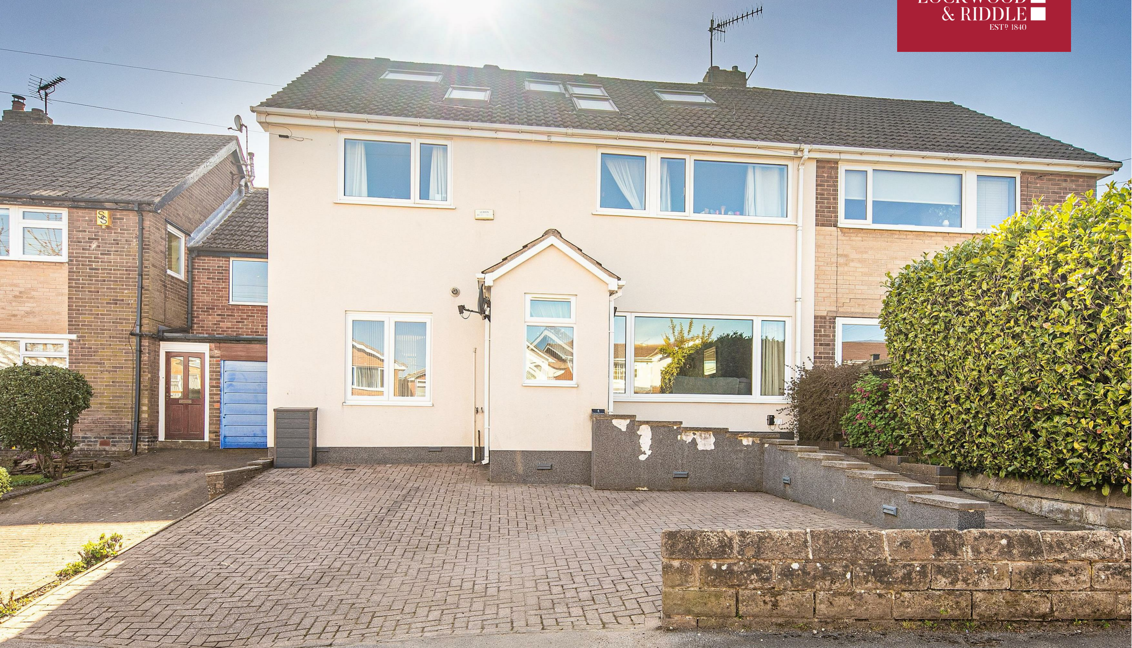
4, Everard Avenue, Sheffield, S17 4LZ