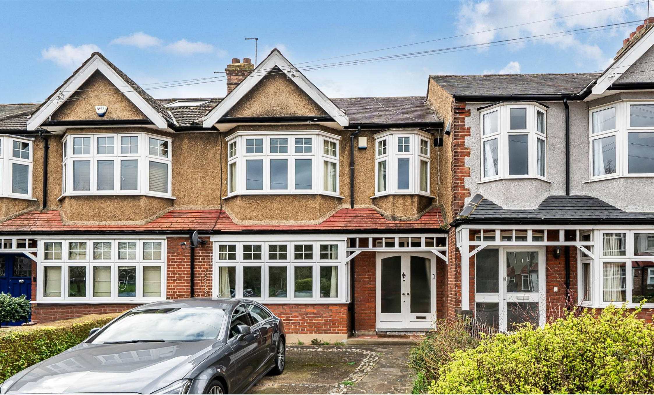
Parsonage Gardens, Enfield, EN2 6JR