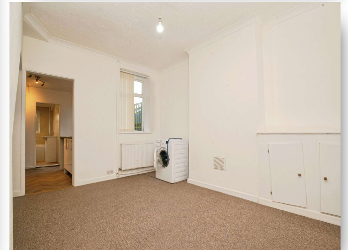
Treharris Street, Roath Cardiff CF24 3HL