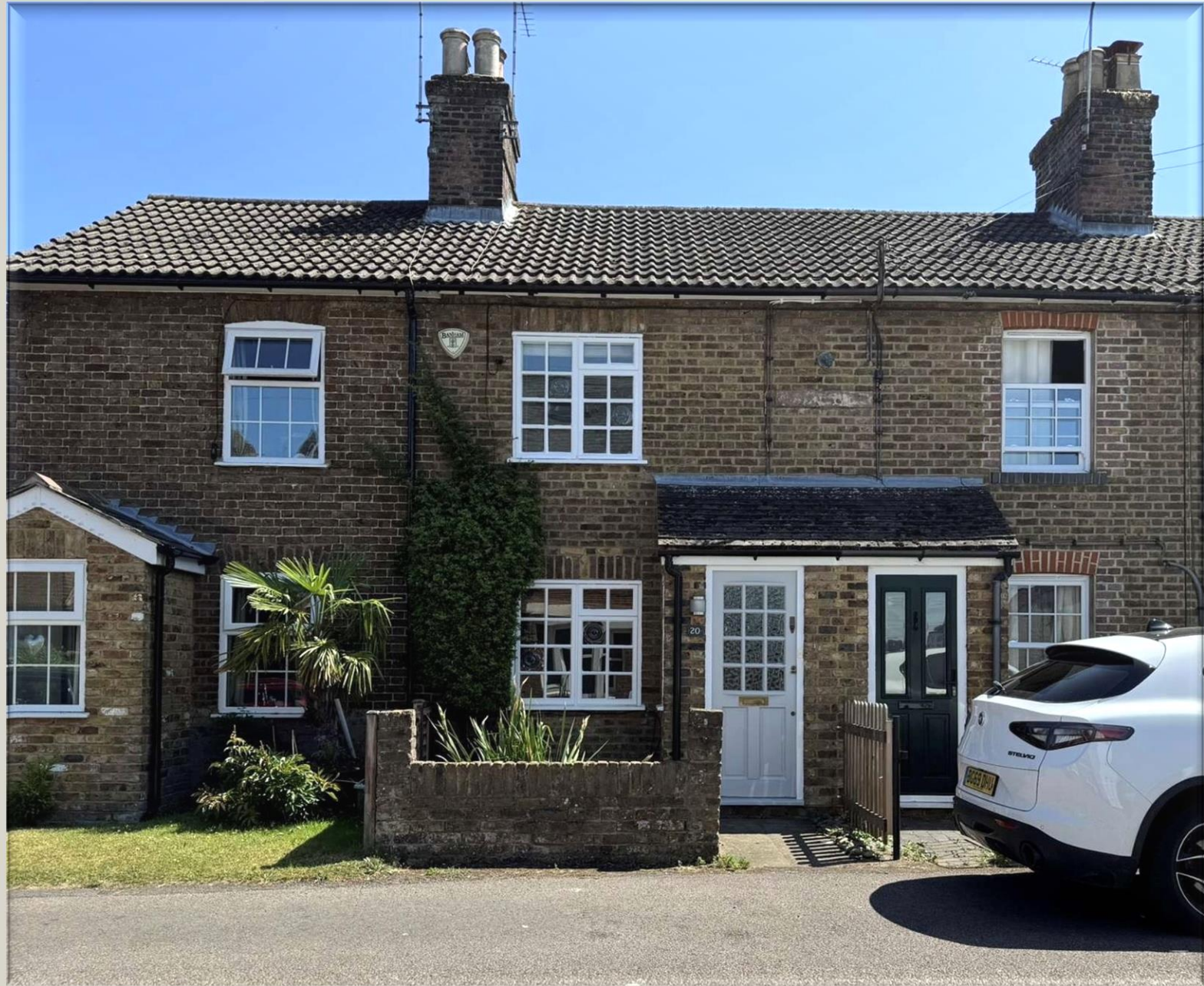
KING STREET, TRING HP23 6BE