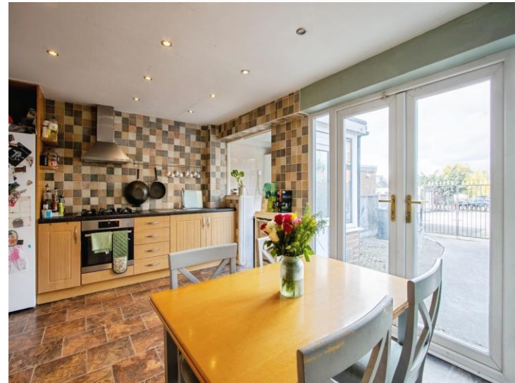
Ramshead Drive, LEEDS LS14 1DG