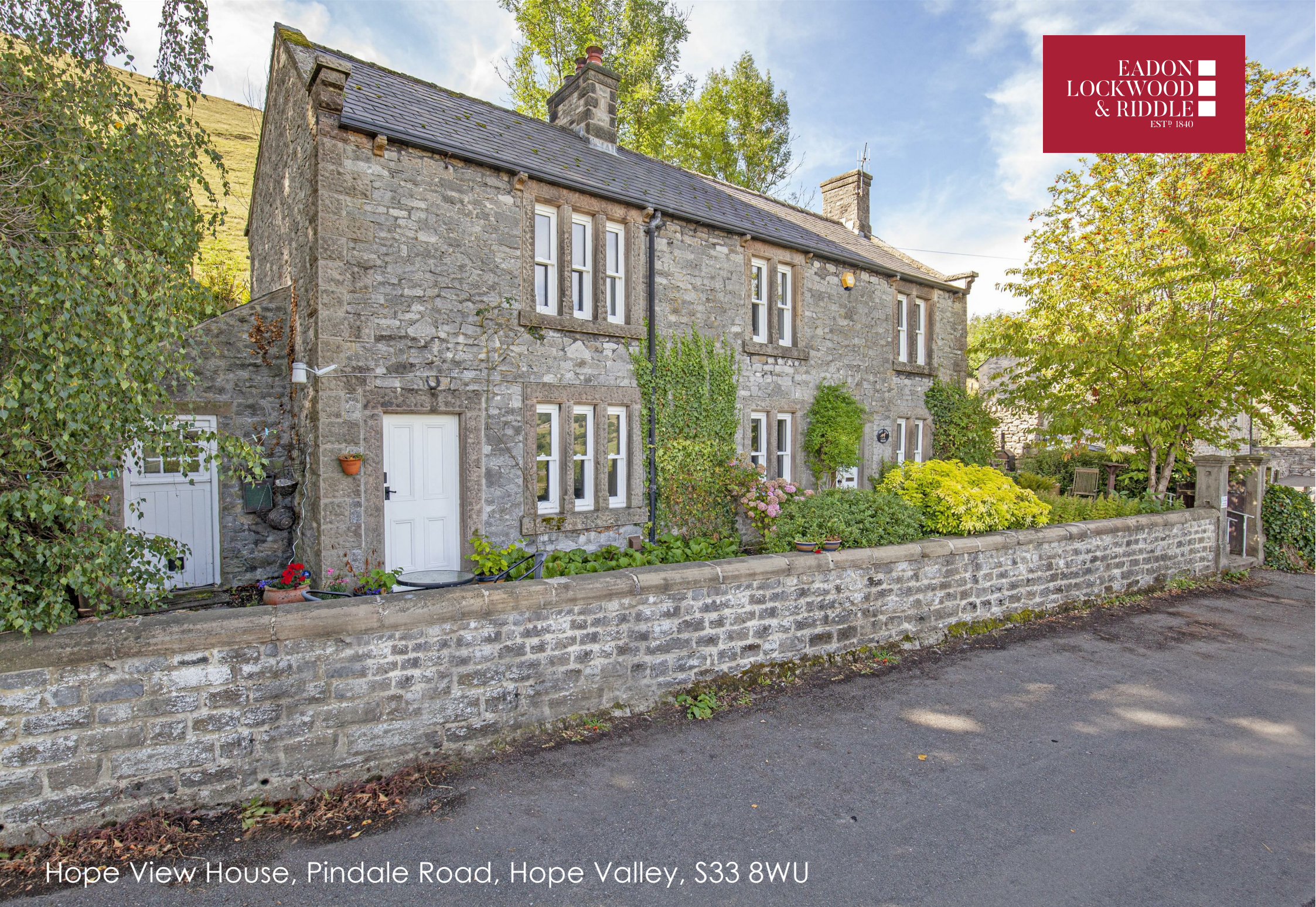
Hope View House, Pindale Road, Hope Valley, S33 8WU