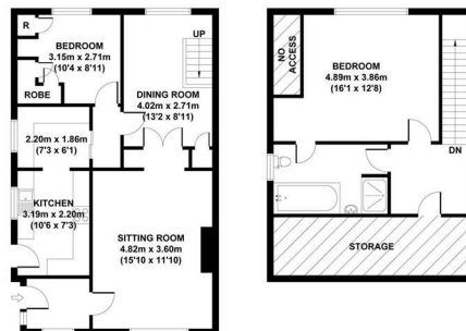
GROUND FLOOR GROSS INTERNAL FLOOR AREA 57 SQ M