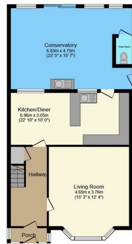
Ground Floor Floor area 92.9 sq.m. (1,000 sq.ft.)