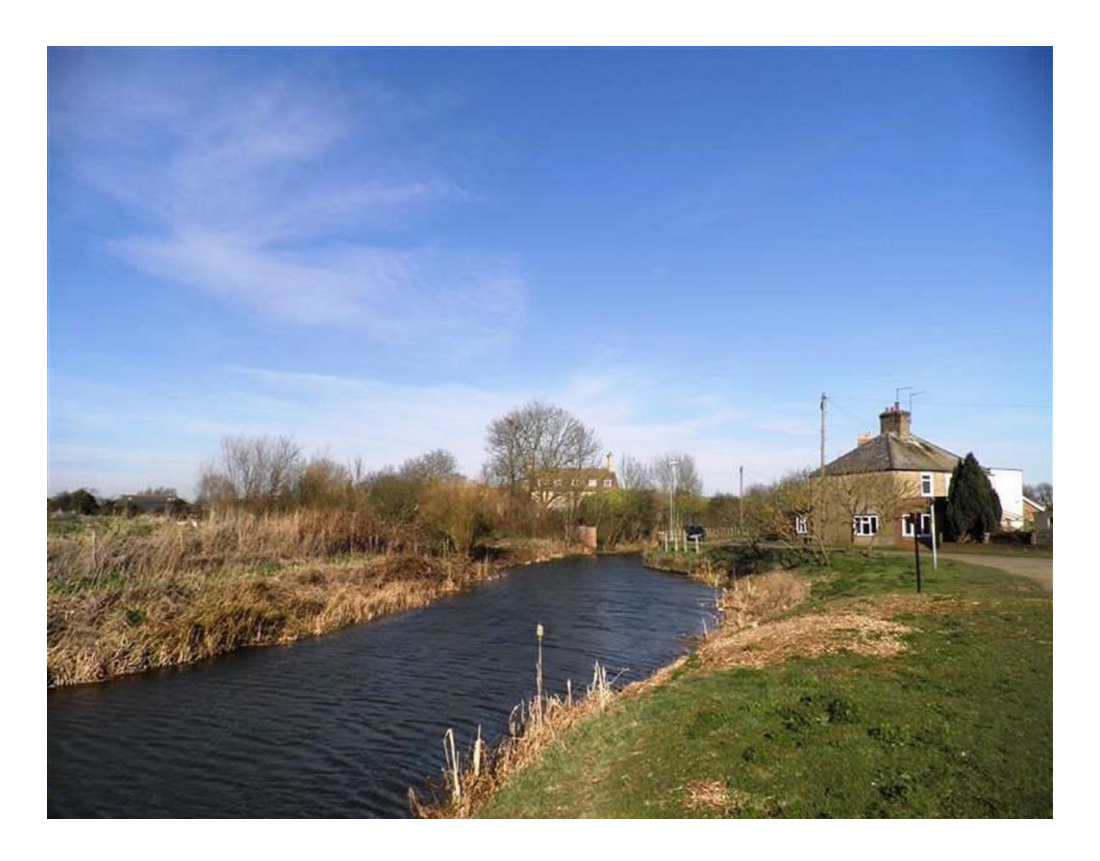
Plot 4 Kings Delph, Whittlesey Peterborough