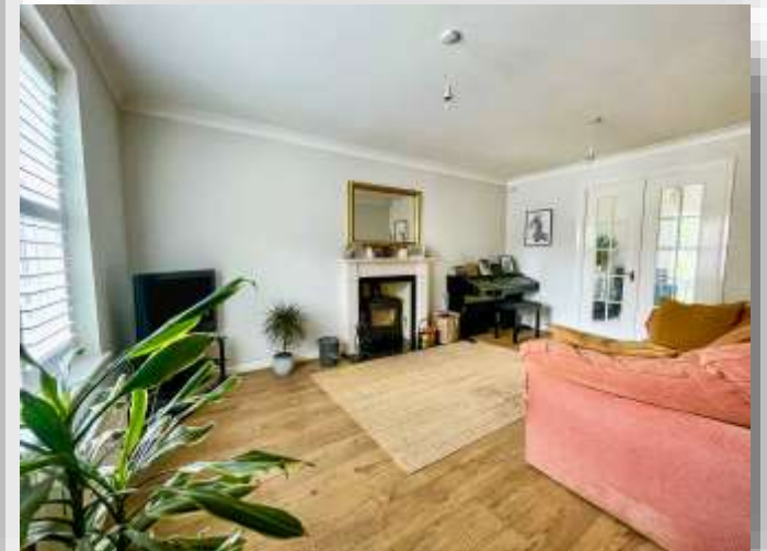
10 The Paddock, Ely CB6 1TP