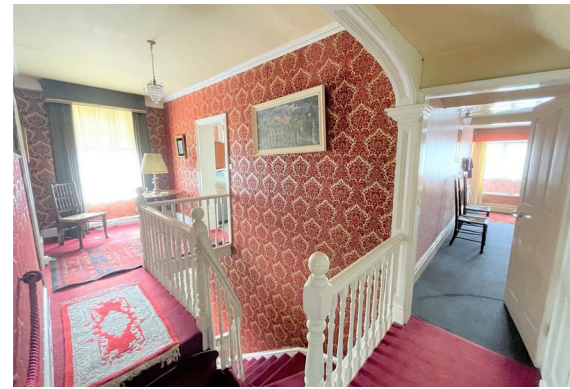
Reception hall 17'7" x 6'9" (5.38m x 2.06m )