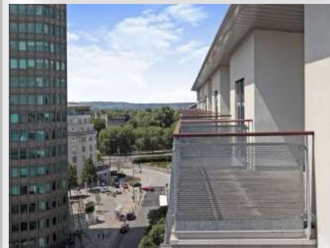
Park View Greyfriars Road, Cardiff CF10 3AL