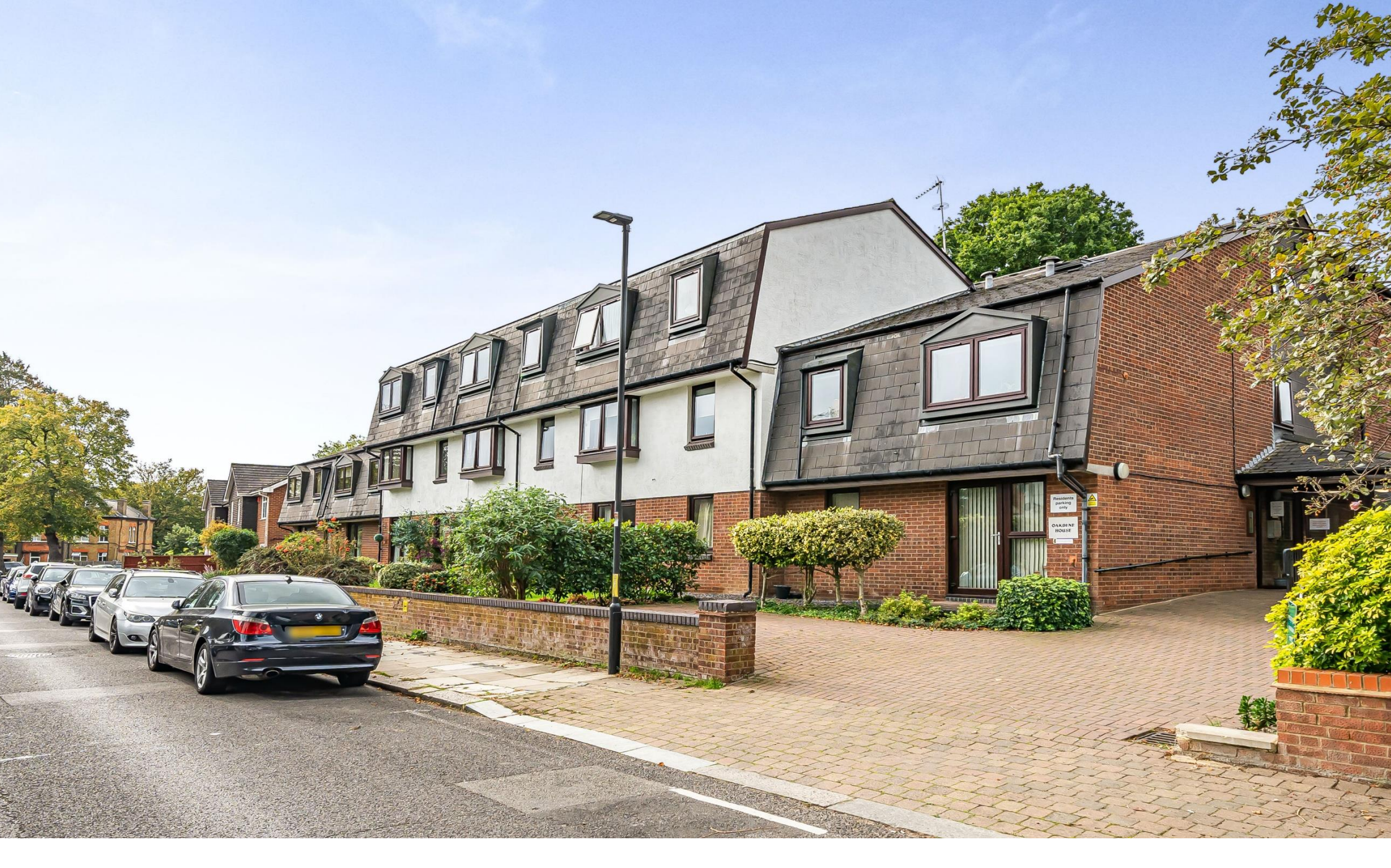
Oakdene House, Bycullah Road, Enfield, EN2 8HB