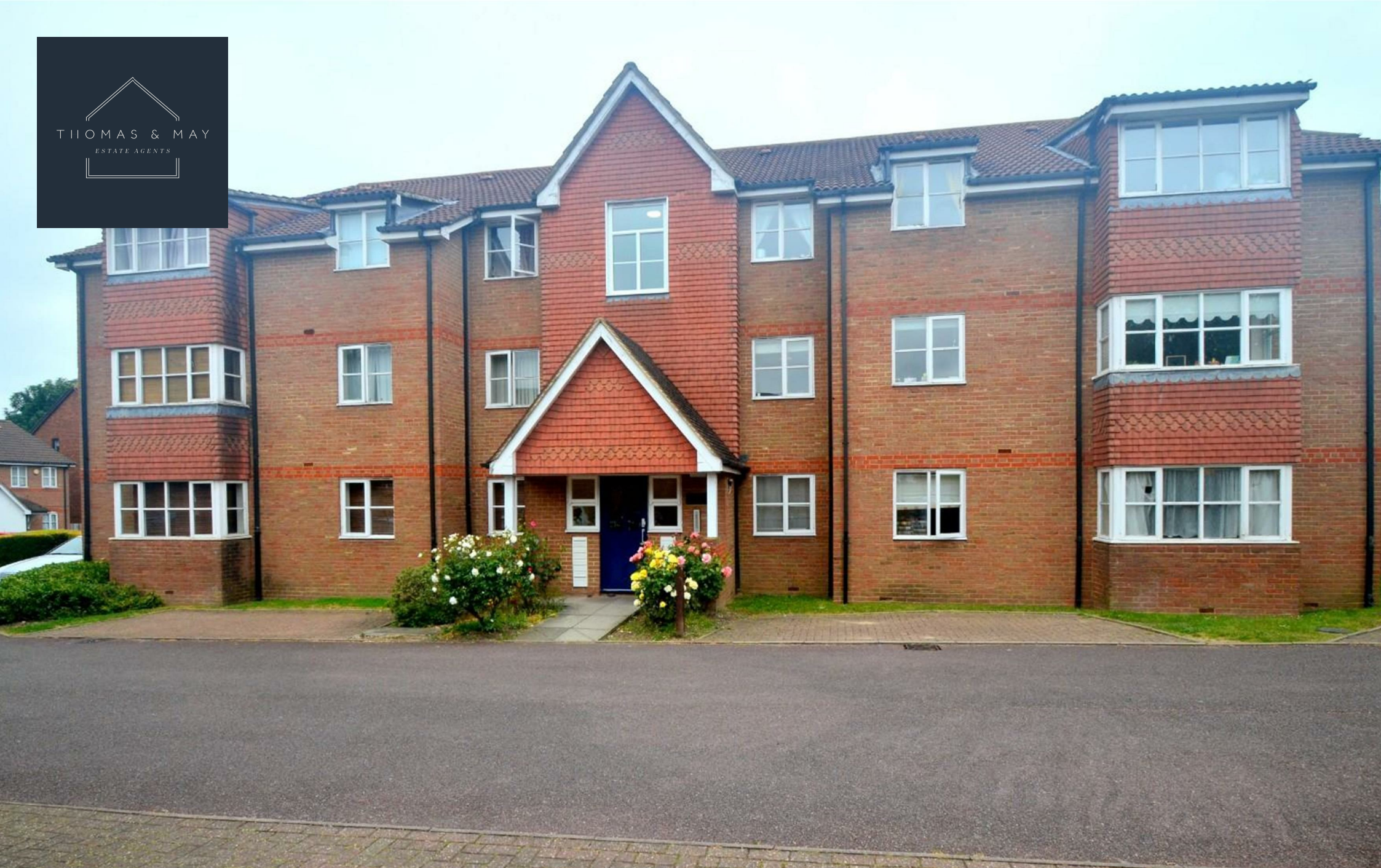
Gilberts Lodge Farriers Road, Epsom, KT17 1NR