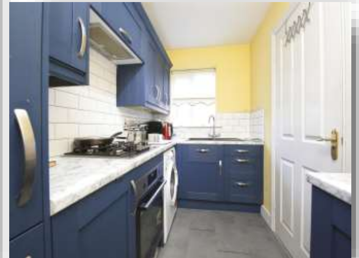
Hart Lane, Hartlepool, TS26 8QP