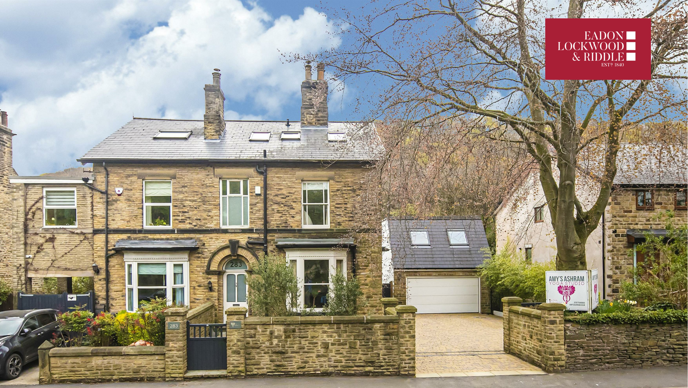
Ryecroft, 283 Abbeydale Road South, Sheffield, S17 3LB