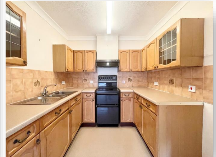
Sawyers Court, Chelmsford Road, Shenfield, Brentwood, CM15 8RH