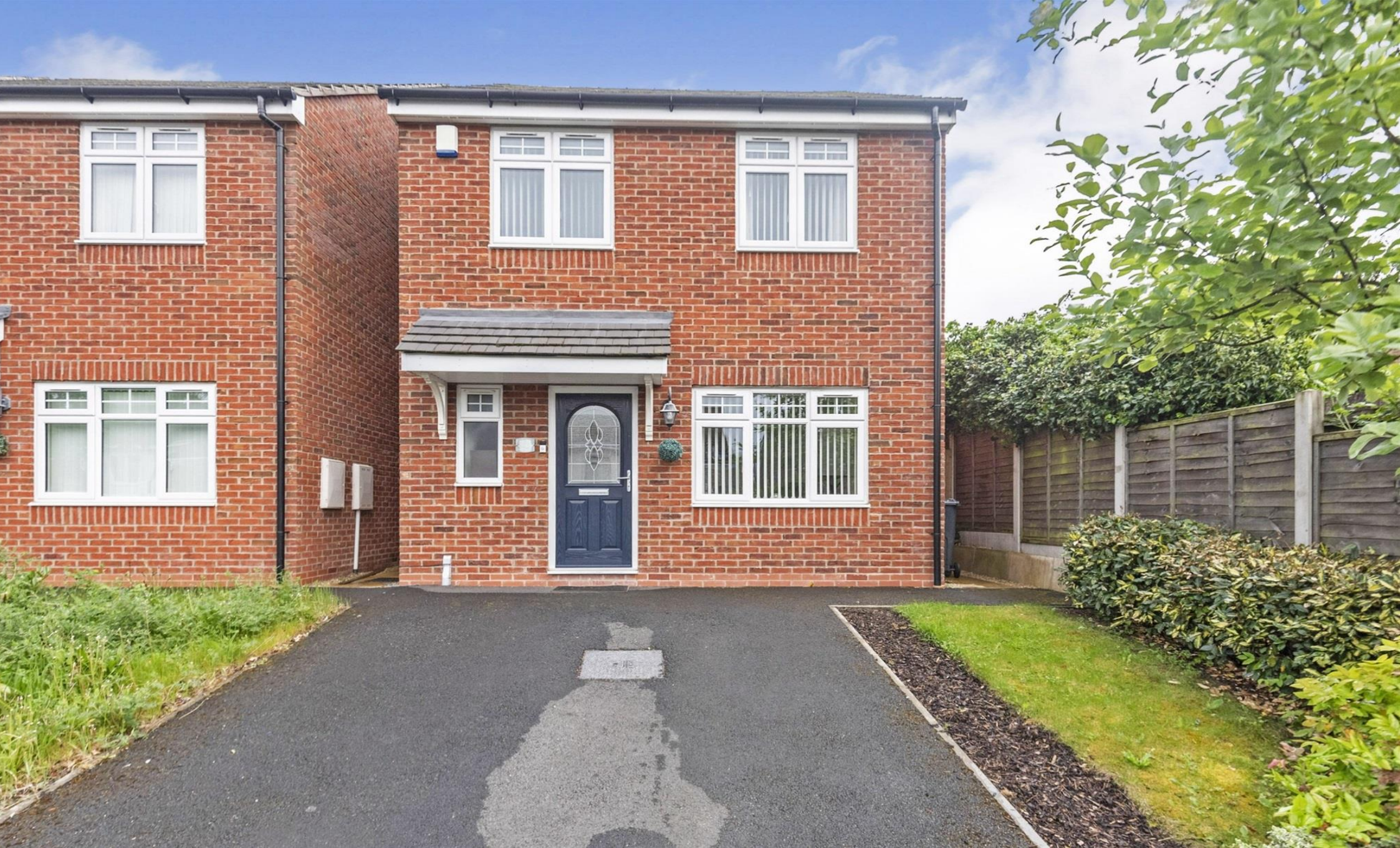
The Villas, Birmingham