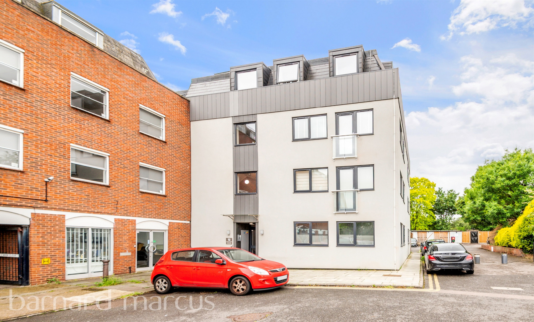
Mercury House, Park Terrace, Worcester Park, KT4 7JZ