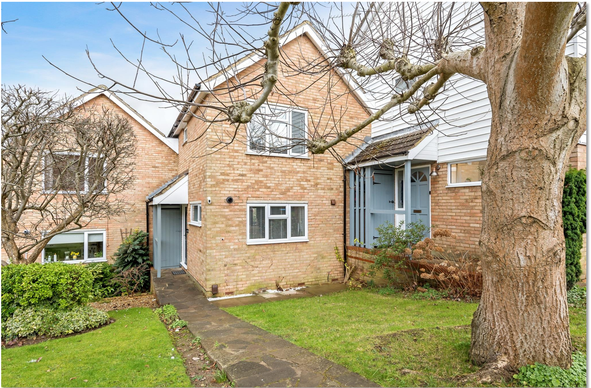
Long View, Berkhamsted HP4 1BY