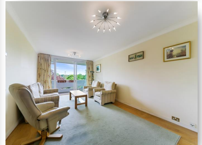
Lakeview Court, Wimbledon Park Road, London SW19 6PP