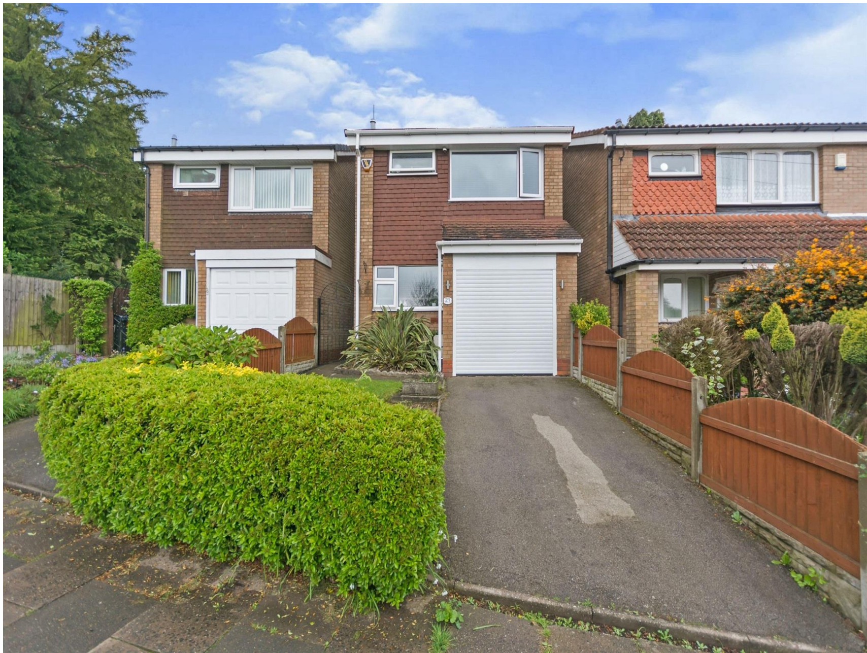
Genners Lane, Bartley Green, Birmingham, B32 3JJ