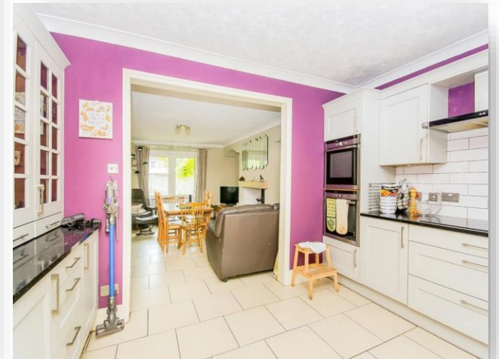
Haven Bank, Boston PE21 8SB