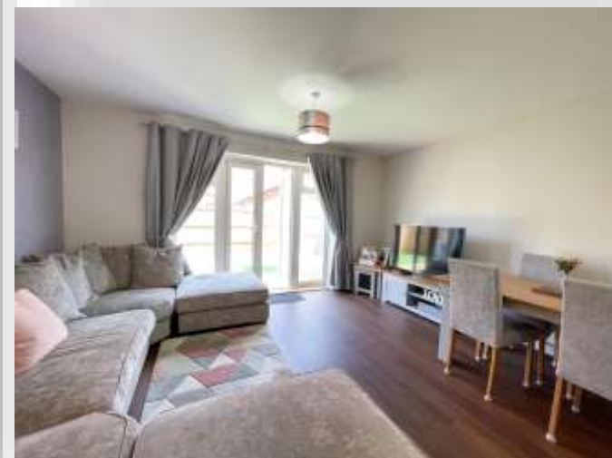
Wagtail Drive, Stowmarket IP14 5GH