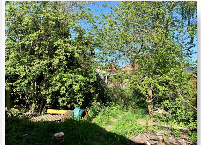
Loughborough Road, Mountsorrel