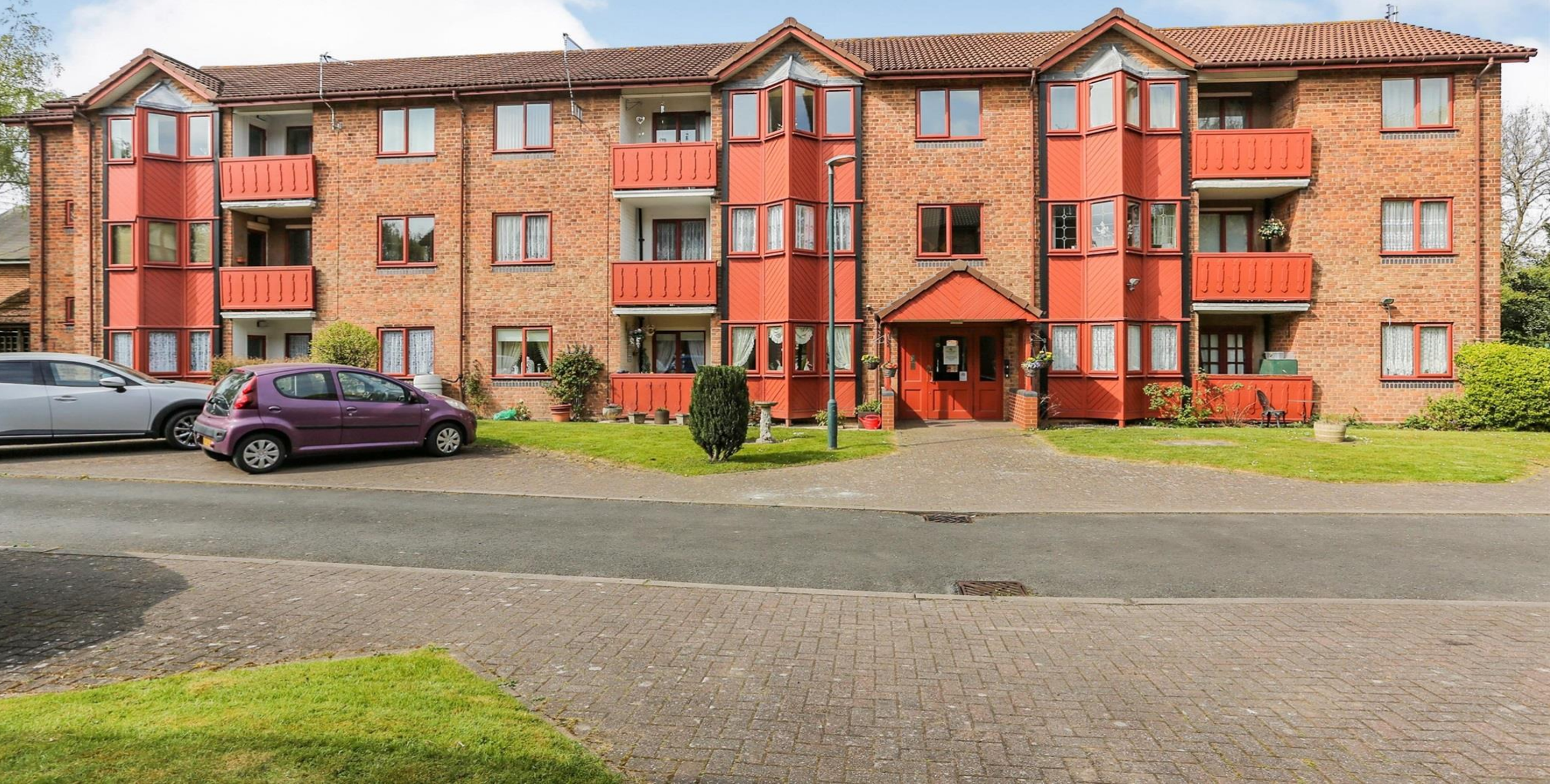
Crofton Gardens Birmingham