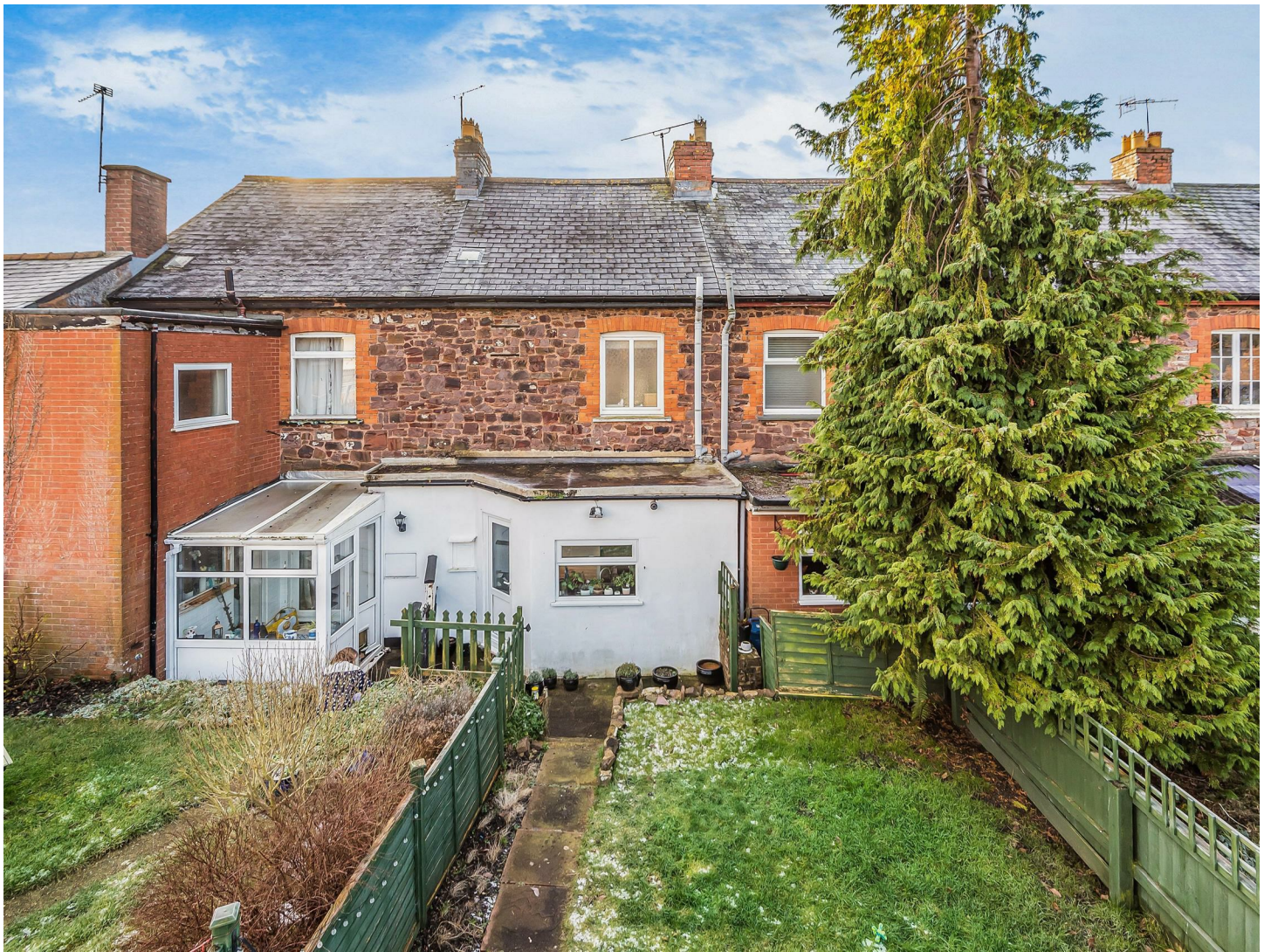
4 Lilac Terrace