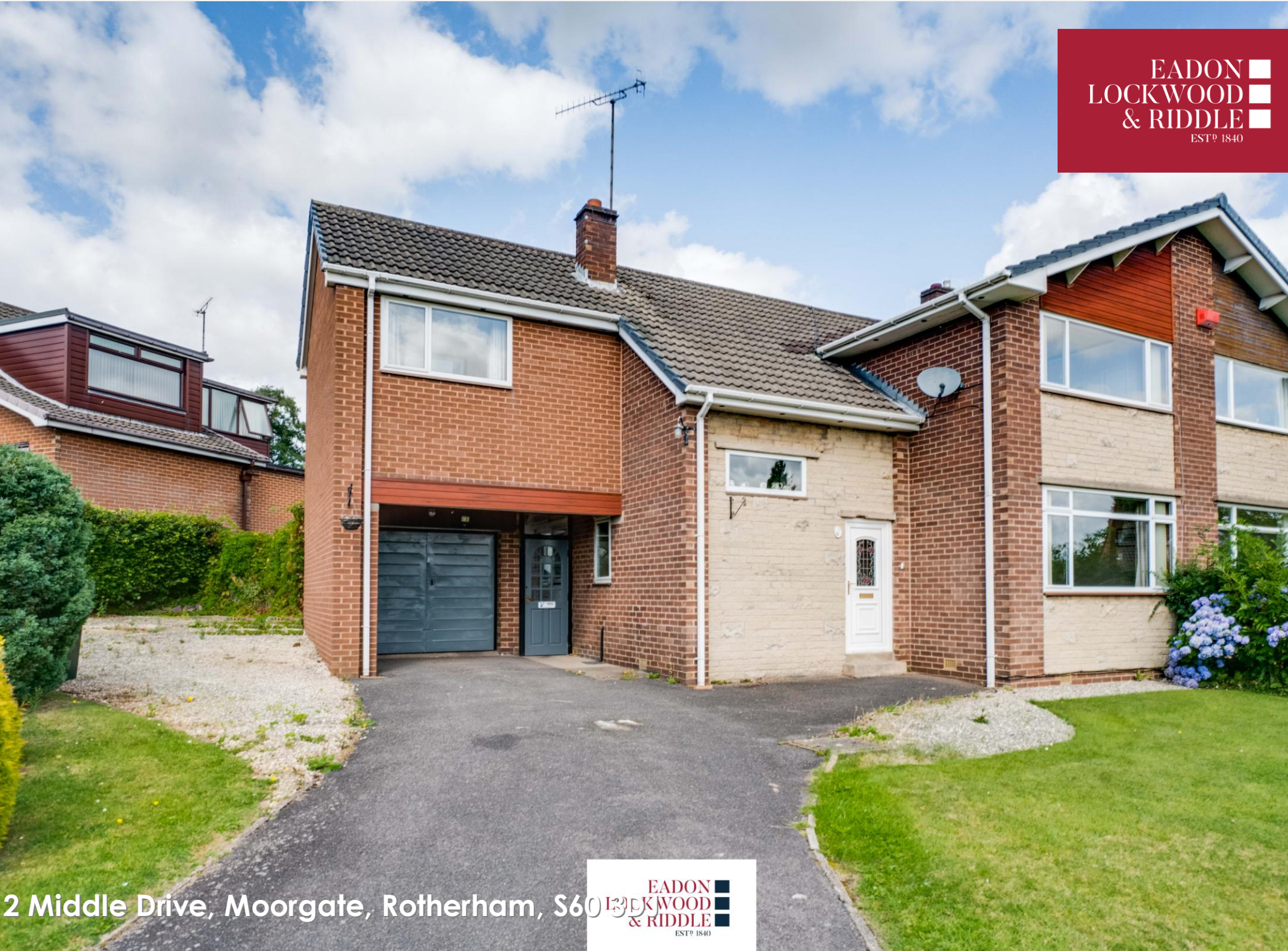
2 Middle Drive, Moorgate, Rotherham, S60 1JZ