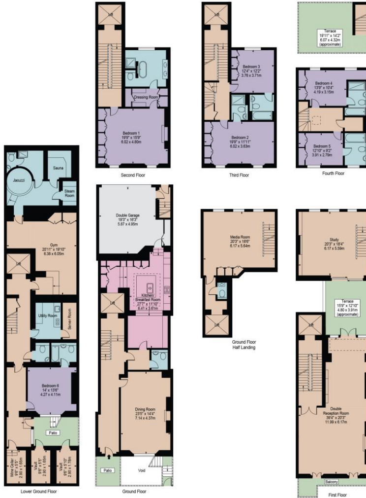
For Illustration Purposes Only - Not To Scale

This floor plan should be used as a general outline for guidance only and does not constitute in whole or in part an offer or contract. Any intending purchaser or lessee should satisfy themselves by inspection, searches, enquiries and full survey as to the correctness of each statement. Any areas, measurements or distances quoted are approximate and should not be used to value a property or be the basis of any sale or let.