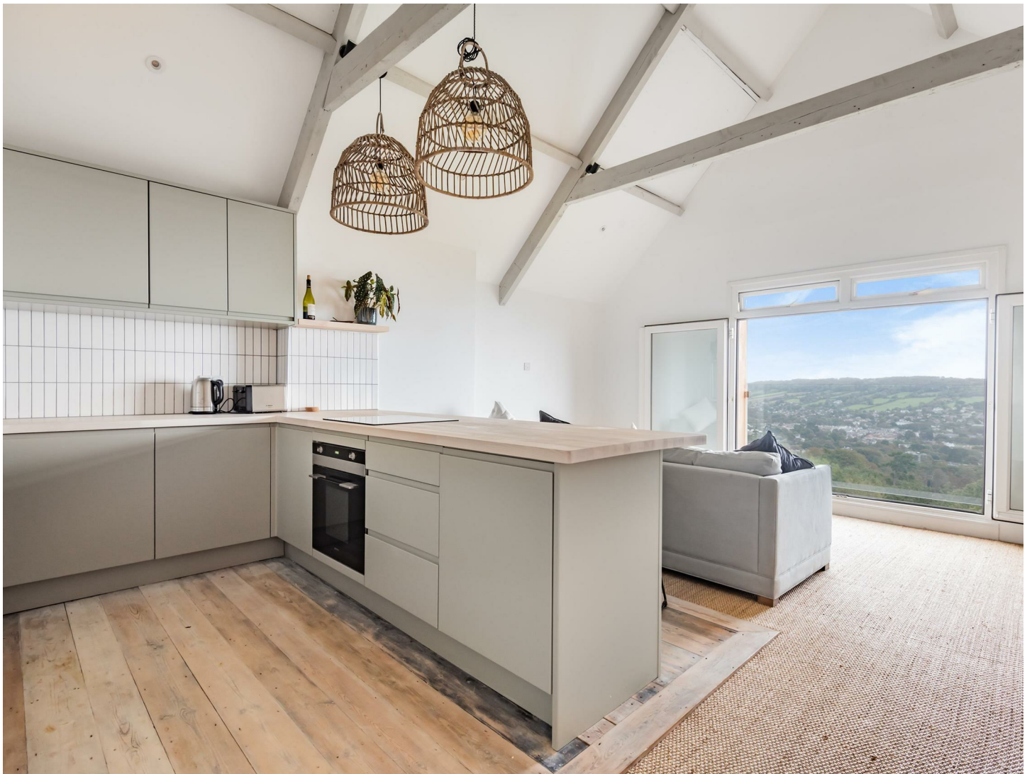
6 Willoughby House