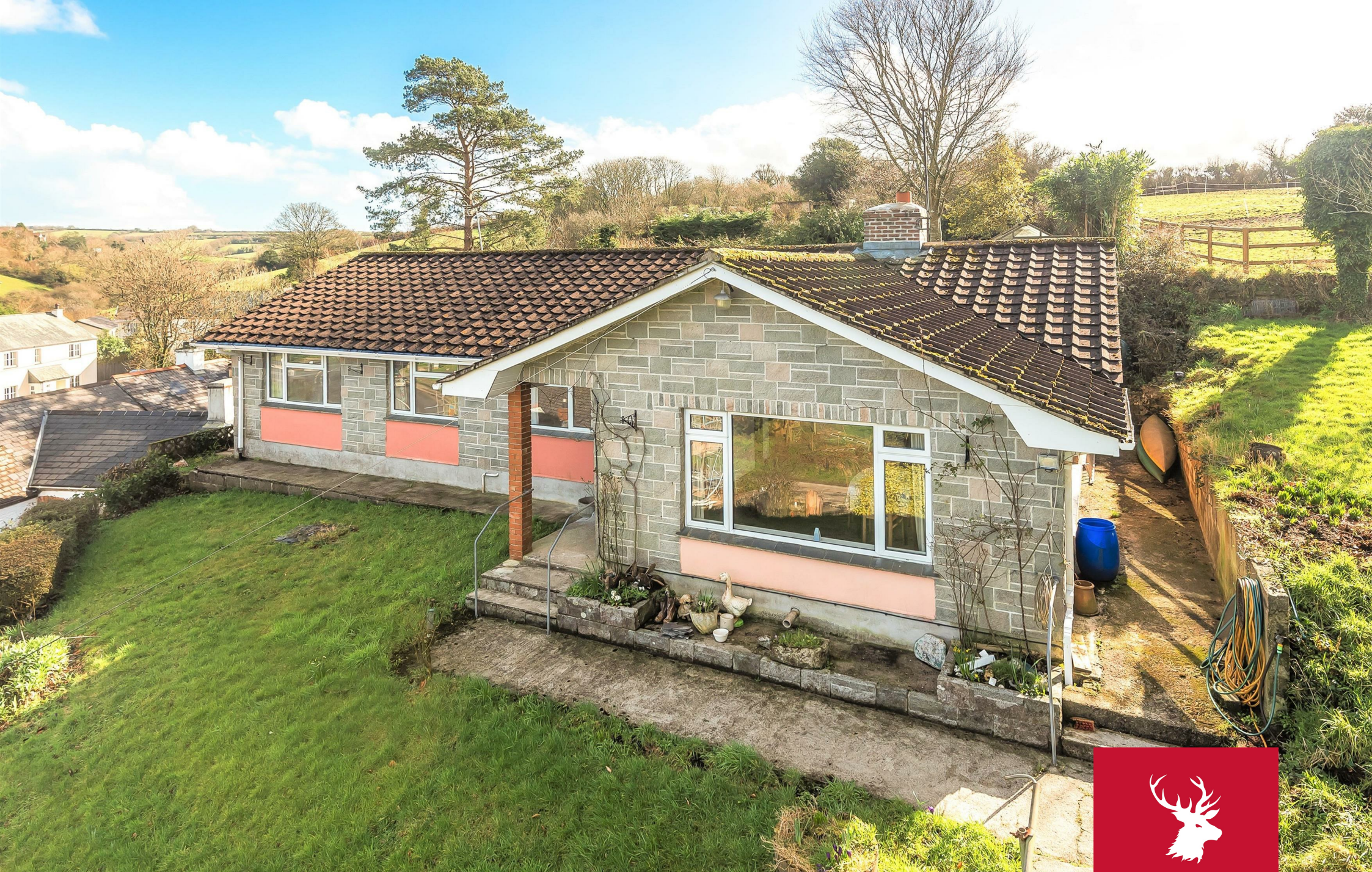
Turnpike Bungalow Daddiport