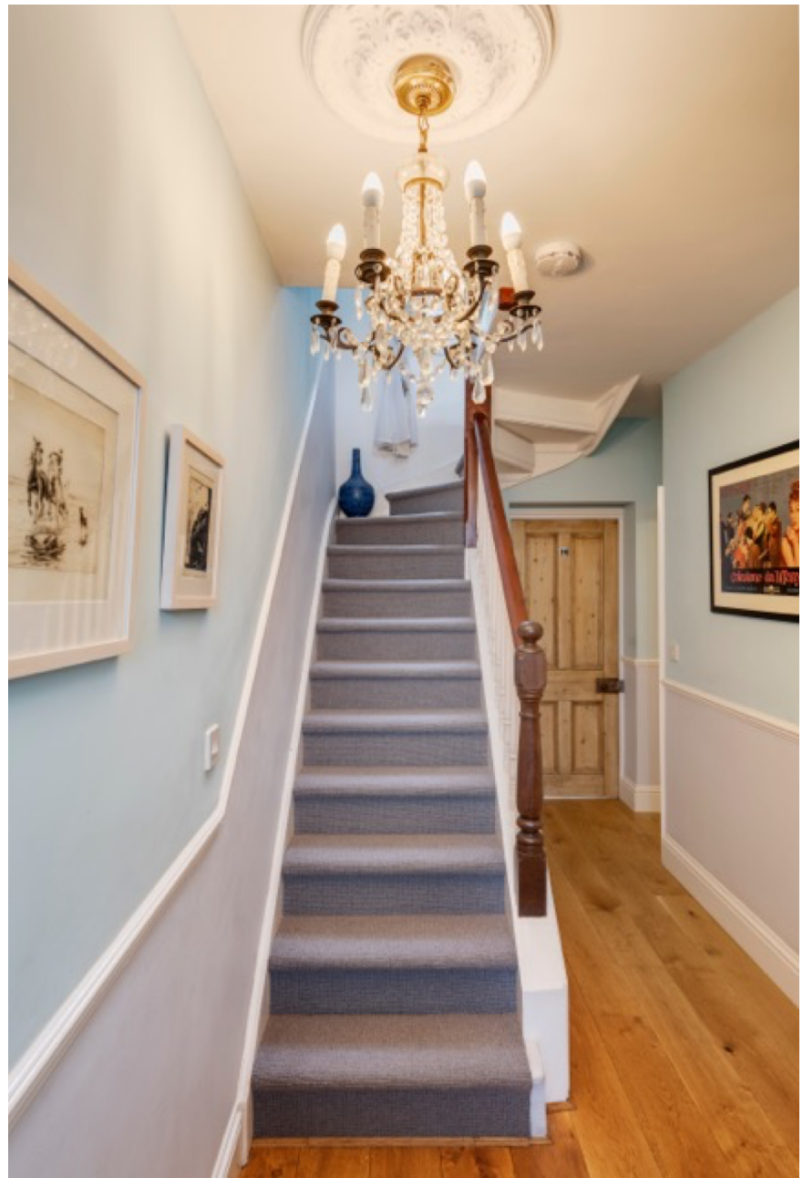
Puffin Cottage 86 Above Town, Dartmouth, Devon, TQ6