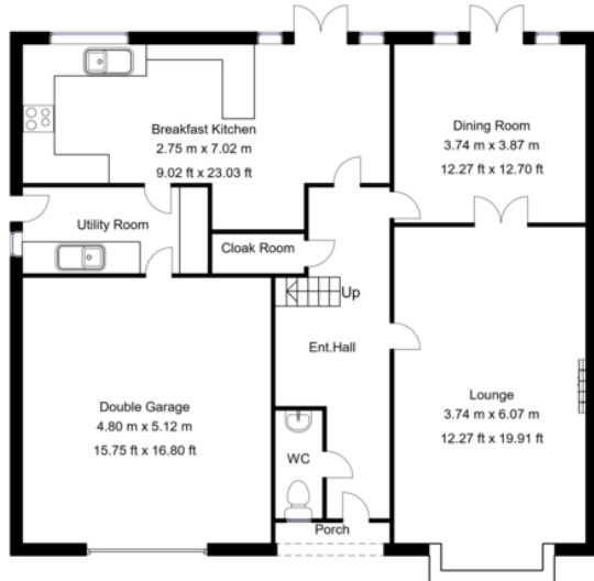
Ground Floor 109 sq.m/1168.47 sq.ft Approx.