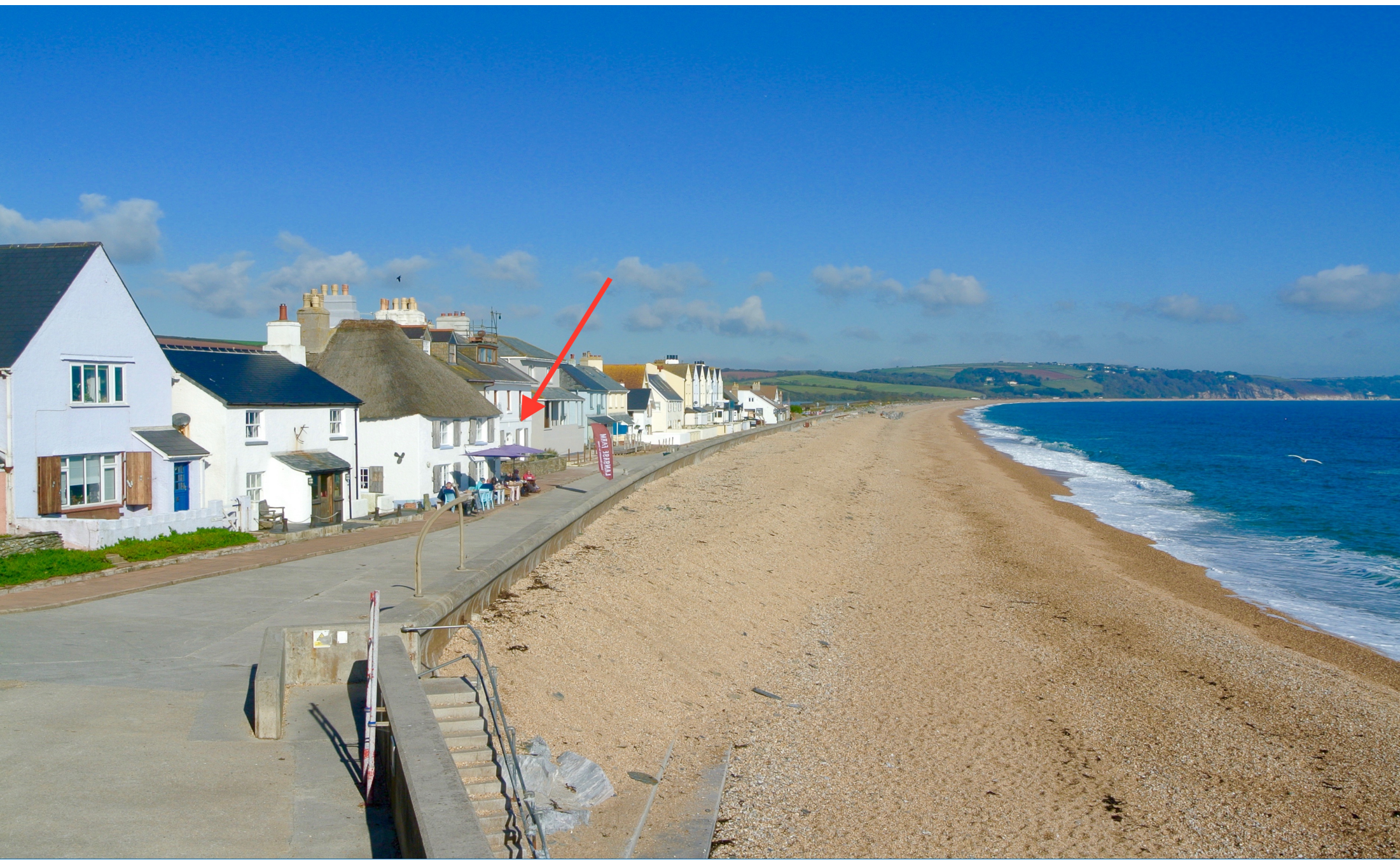
1 Bay View, Torcross, Devon, TQ7 2TQ