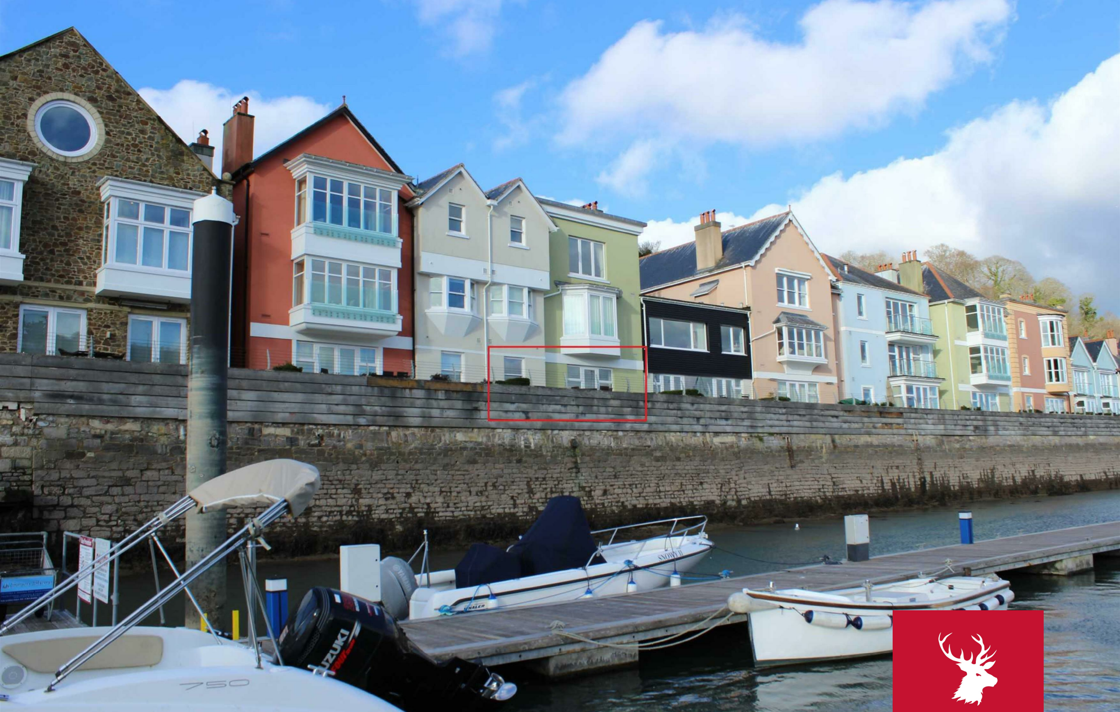
6 Dart Marina