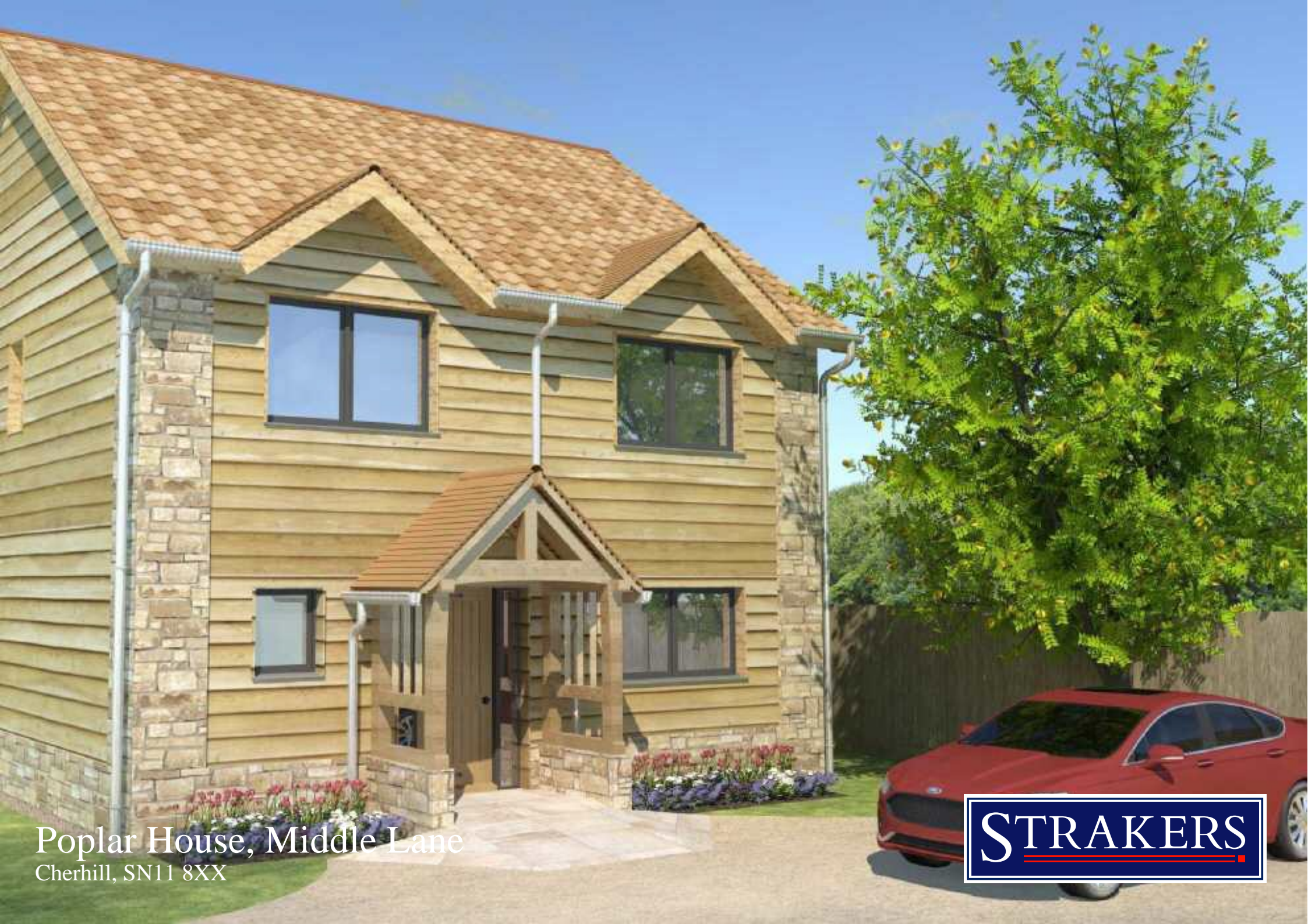
Poplar House, Middle Lane Cherhill, SN11 8XX