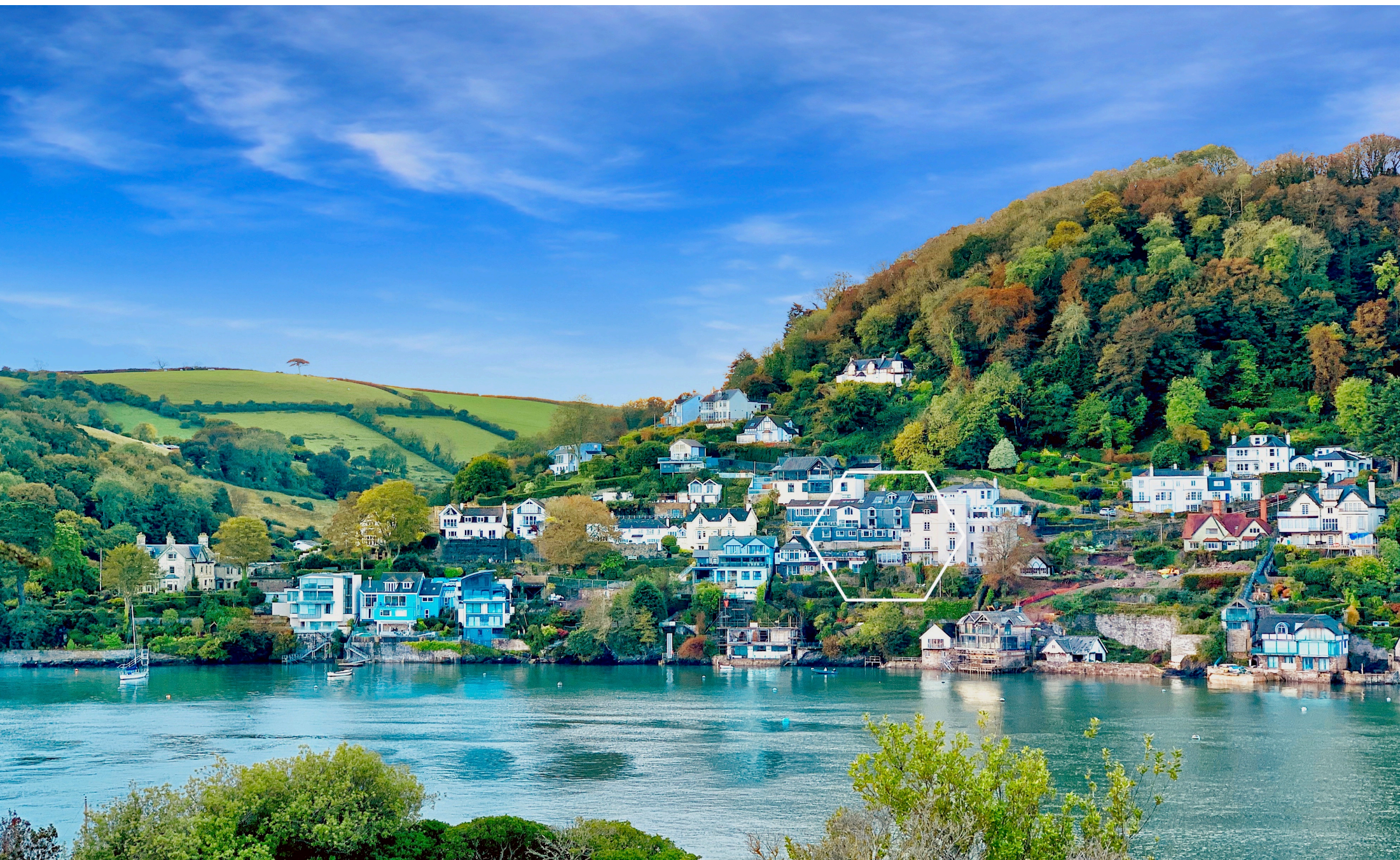
Lower Deck, Dartmouth, Devon, TQ6 9BZ