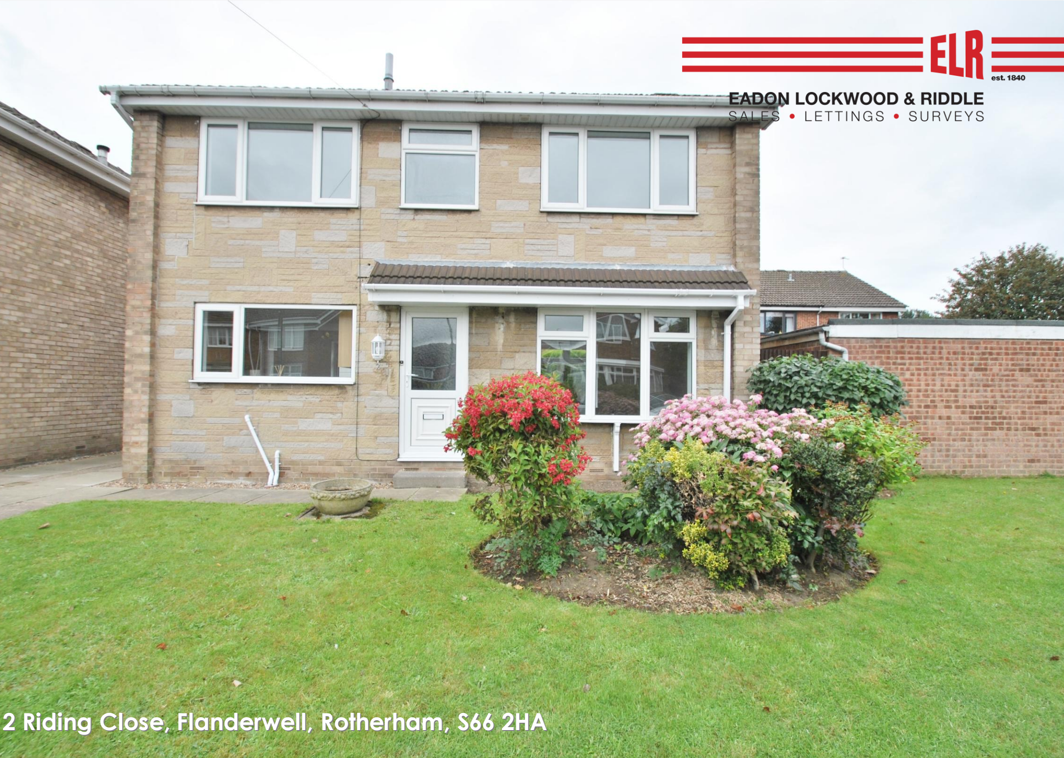
2 Riding Close, Flanderwell, Rotherham, S66 2HA